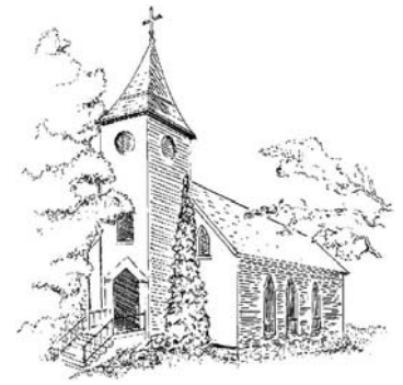
St. Mary of the Rosary, Hepworth Sunday 9:00 am (Nov-Mar)

Email: smm@bmts.com www.stmarysandthemissions.ca